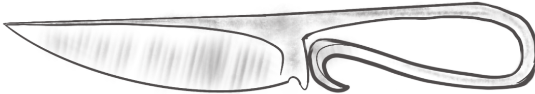
Style 1 Traditional Viking-Style Blacksmith Knife

The four-hour blade-smithing session includes a hands-on intro to blade-smithing. Each participant will forge, shape, grind, quench, temper, and edge their own knife and take home a finished product. There are two basic knife design options for the Intro to Blade-Smithing class. Each participant may choose which style they want to make: